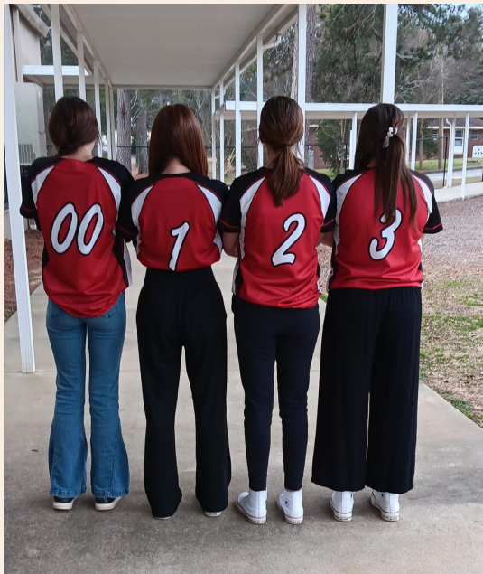
Softball is in full swing, come support our girls!