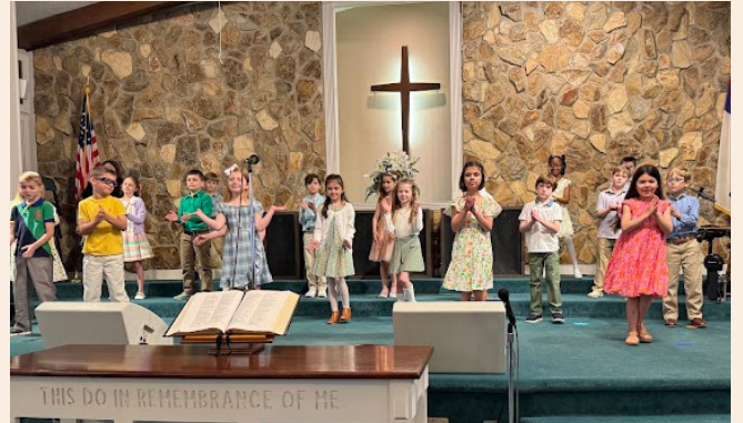
2nd grade Easter program