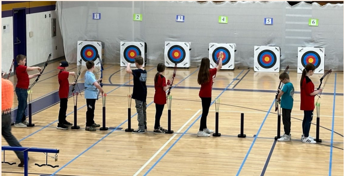
Cheer on our Crusader archers as some of them compete in the state tournament next week!