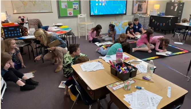
4th grade reading buddies